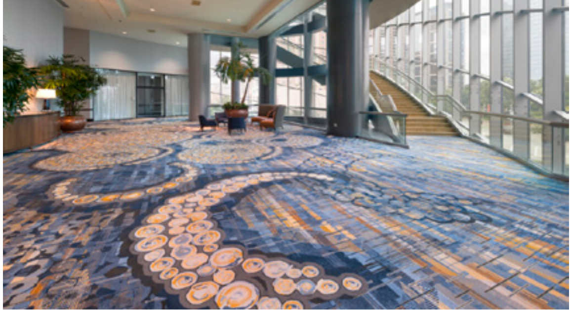
Hilton Americas- Houston